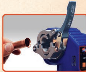
AUTOMATIC FLARING COMPLETED REMOVE TUBE