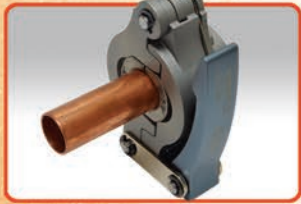
FLARING CLAMP WITH TUBE STOP LIMIT PLATE